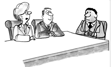
"I had a miraculous dream in which our list of questions all had answers."

We would like to have your views on the structure and content of the Branch to help us determine if we are both meeting the needs of the Branch and helping the Branch to grow. Are Saturday's the best day for the Branch to meet or would a week-day be preferred? Are the times of meetings suitable to members? Are we meeting your needs in terms of your research?